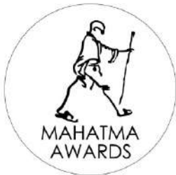
Mahatma Award for 'Gender Equality', 2024