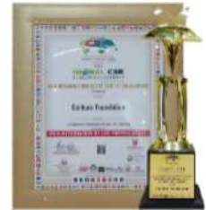
Global CSR Excellence Award for 'Women Empowerment', 2024