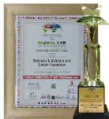
Global CSR Excellence Award for 'Best Implementation of 21st Century Skills', 2024